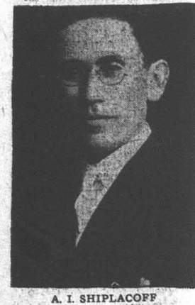
The First Socialist Assemblyman has from New York dances

sey circles are requested to reserve the date, July 1st, and not make any conflicting engagements. ----