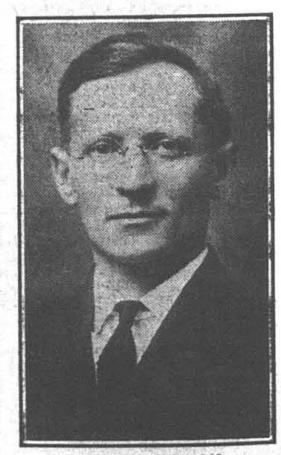
MEYER LONDON The First Socialist Congressman from New York ----